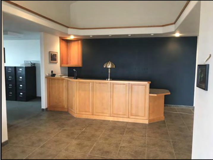
Front reception/ lobby area