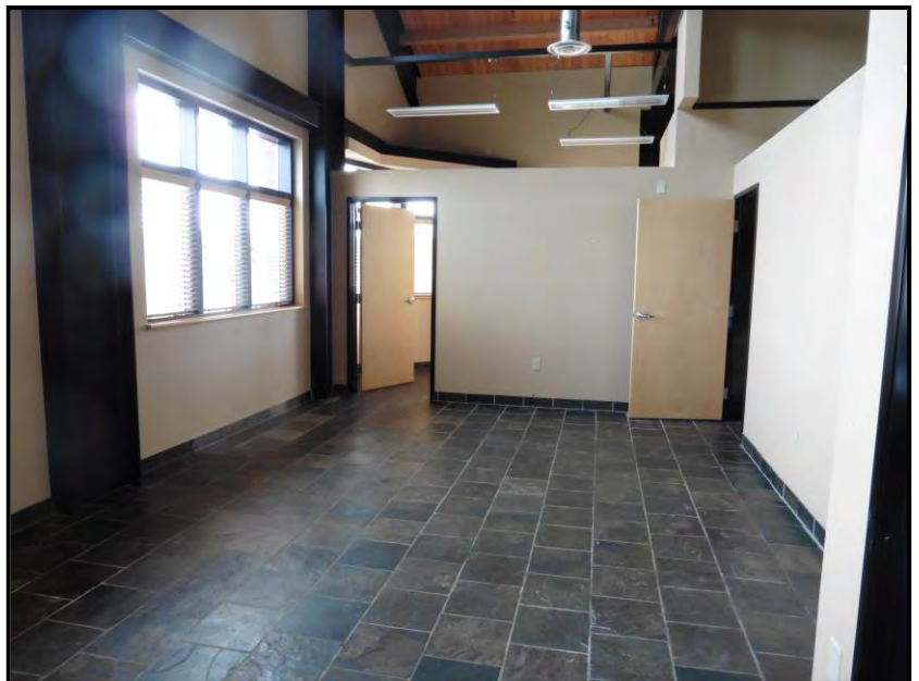
Reception and work area