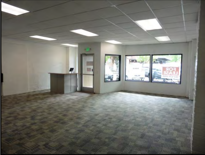
Second Street Entry

Open floor plan with access to City parking lot & finished basement