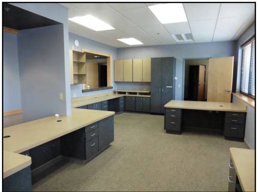
Reception and work area