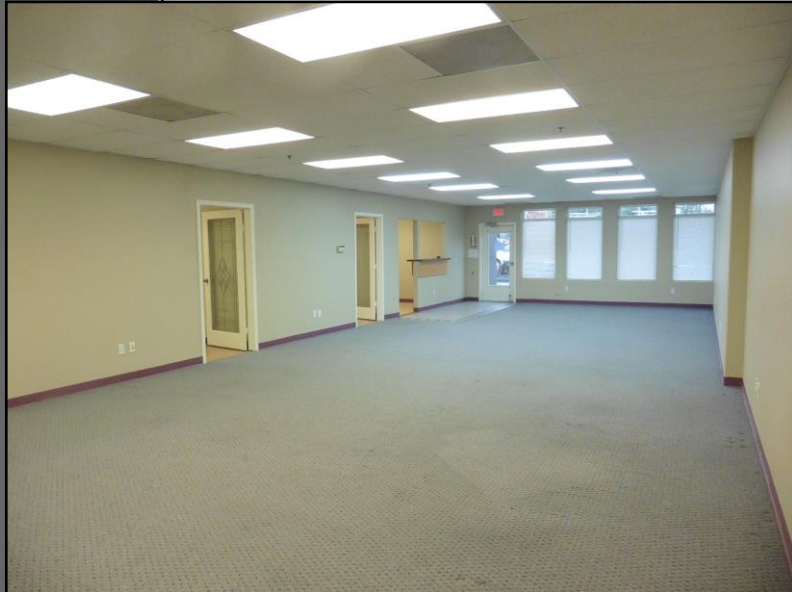
Office area as viewed from rear