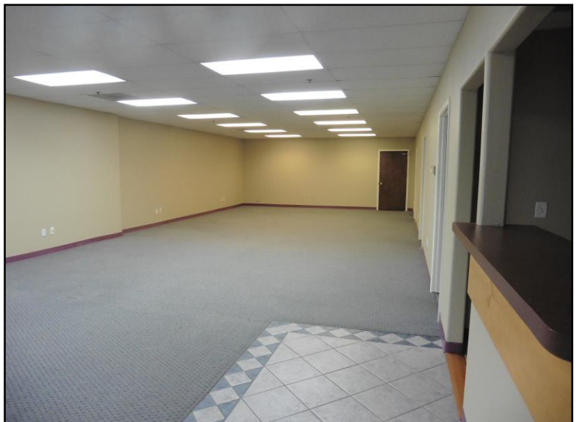
View looking from entry