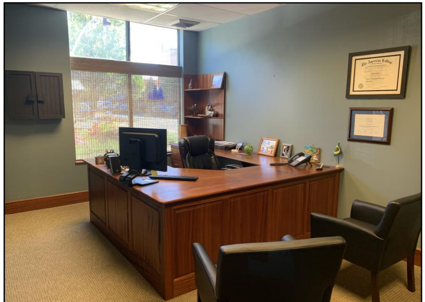
Typical office with large window for natural light.