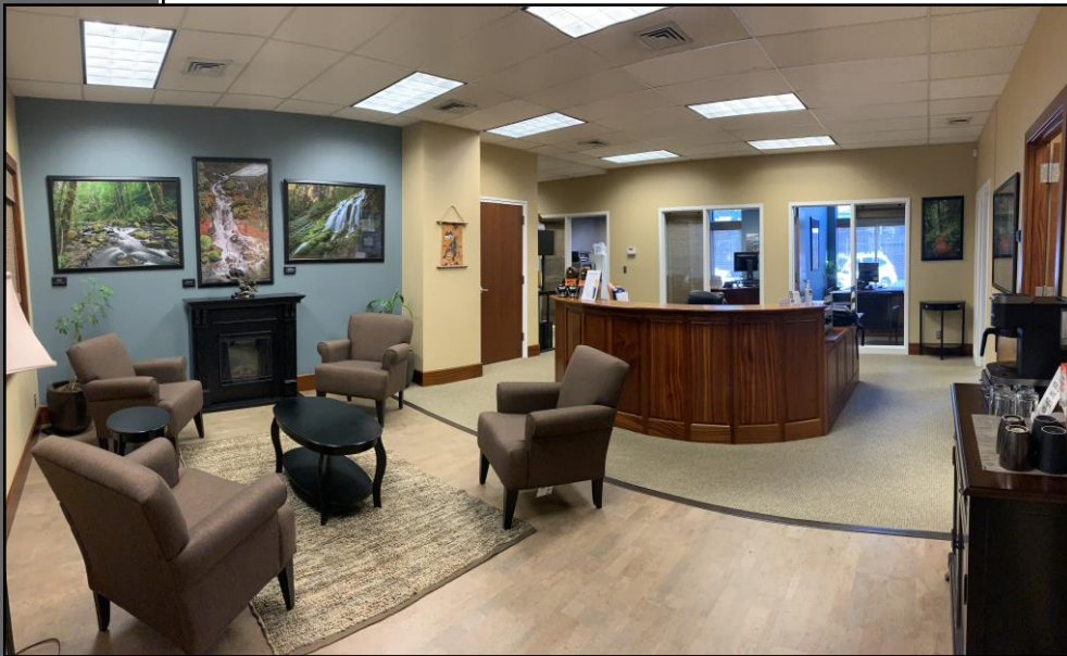
Front reception and waiting area.