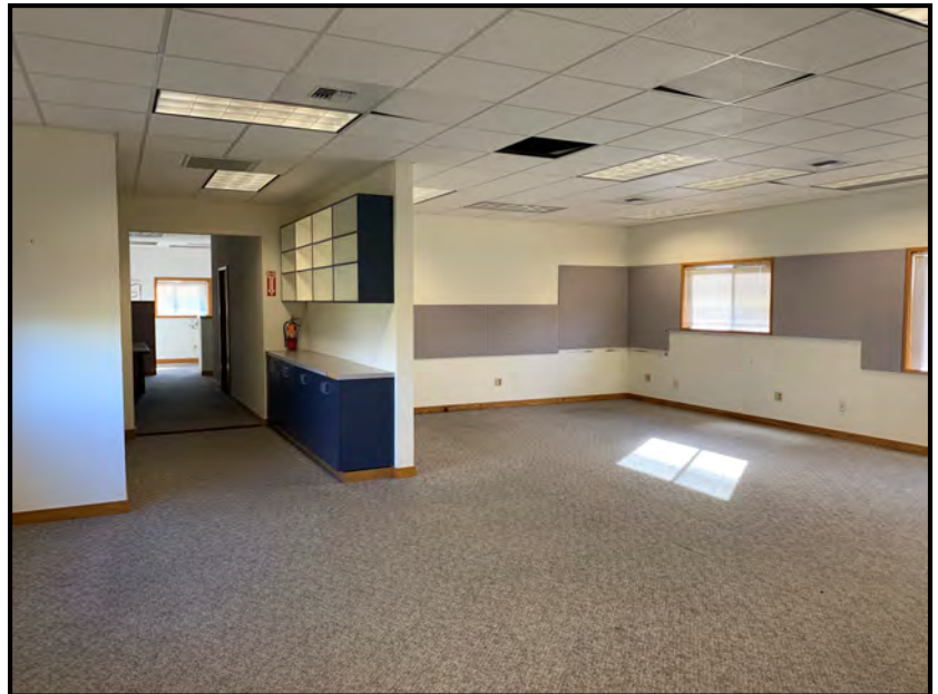
Open work area with offices in back