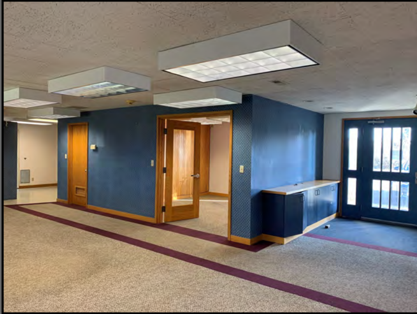
Entry and conference area