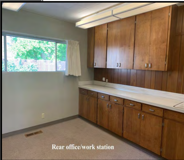
Rear office/work station