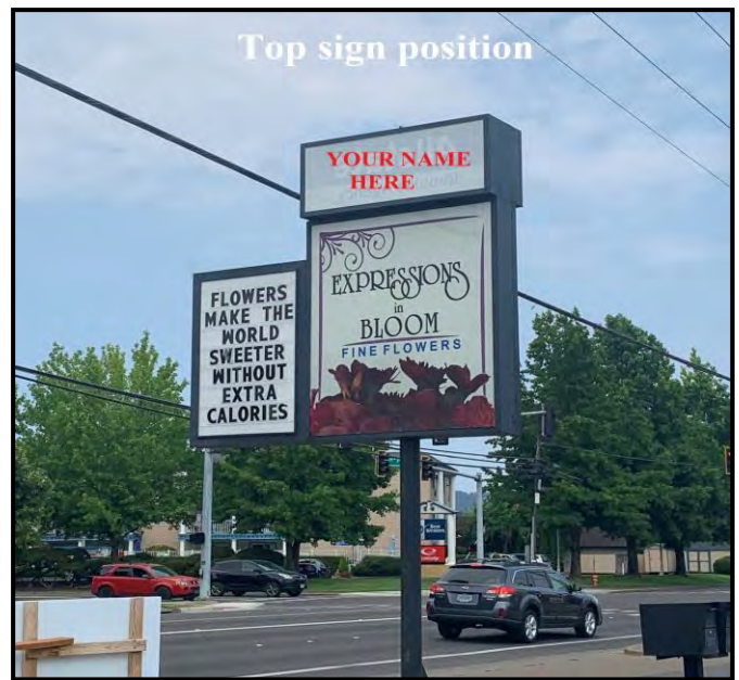
Top sign position